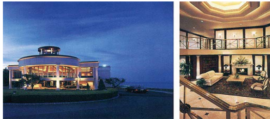
Pictured is the Glen Island Harbour Club, New Rochelle, New York.

The NYC Troop of the New York State Police will be holding its first annual Awards and Retirement Dinner on Thursday, May 5 th , at 6:00PM. The event will take place at the Glen Island Harbour Club, located on Weyman Avenue and Glen Island Park, New Rochelle. Tickets are $75 per person. For those interested, please call 917-492-7108/7111.