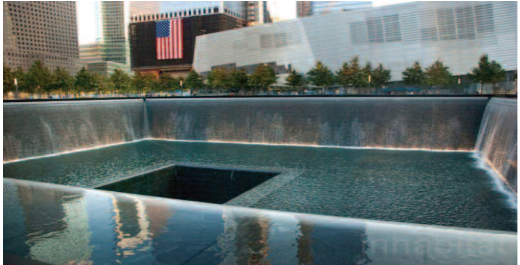
National September 11 Memorial and Museum

After a long, hot summer, the NLEA Board has reconvened to begin planning our autumn, winter and spring slate of events. However, before discussing the usual NLEA business, we would like to acknowledge the tenth anniversary of the 9/11 attacks. As we reflect on the events of 9/11, let us take a moment to resolve to never forget. All across our region, state, nation and the world, 9/11 memorials have been erected to help ensure the memories of those who perished on that fateful day are always at the forefront of our individual and collective conscience, and to remind us of the ever-present threat of terrorism. Presented below are photographs of the World Trade Center memorial. For those who are interested, we have attached photographs of 9/11 memorials from across the NYC area, nation and the globe at the end of this newsletter.