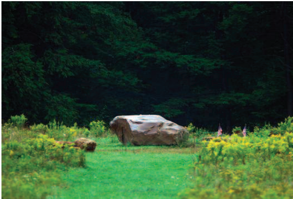
Shanksville, Pennsylvania. This 17-ton boulder marks the spot where United Airlines Flight 93 hit the ground.