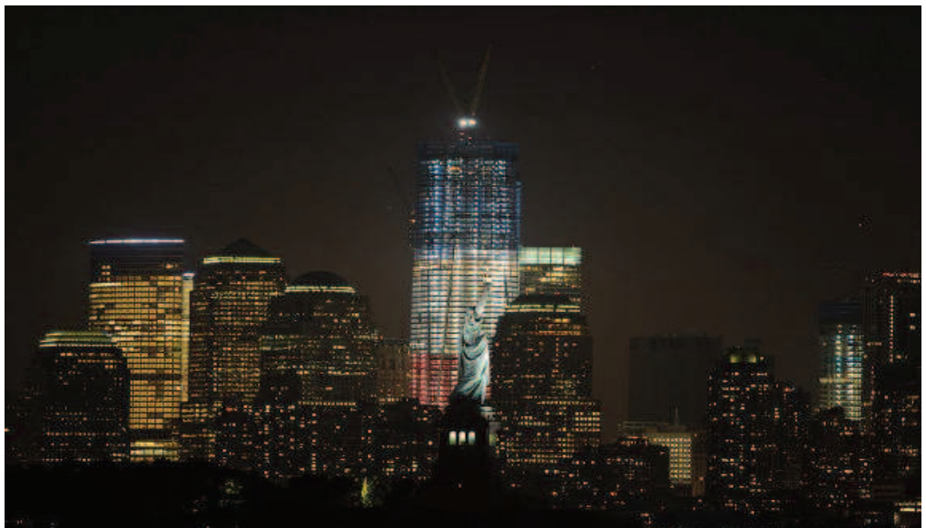
The Freedom Tower perfectly aligned with Lady Liberty.