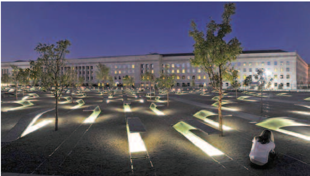
The Pentagon. There are 184 beams of light on display.