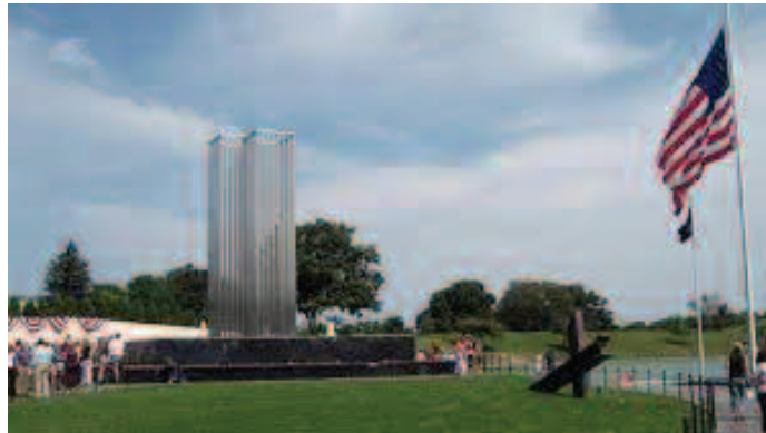
Nassau County, NY - 344 Nassau County residents lost their lives on 9/11.