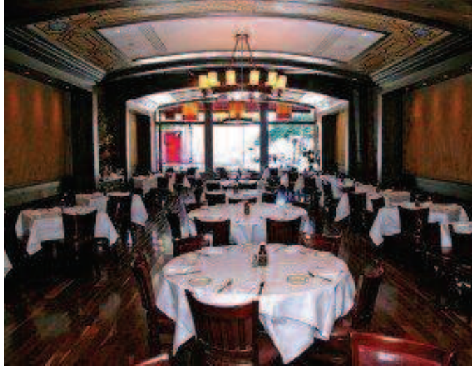
*The main dining room at Wolfgang's Steakhouse