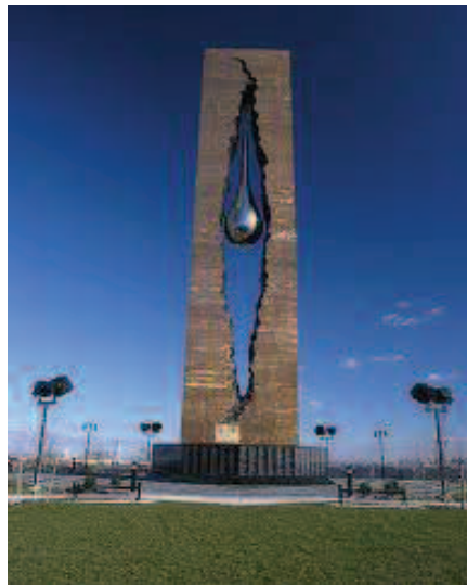
"Tear Drop" Memorial: Bayonne, New Jersey. A gift from the Russian people, This memorial stands 100 feet high, and has a 40 foot long stainless steel tear drop suspended in its middle. 674 New Jersey residents died during the attacks on 9/11.