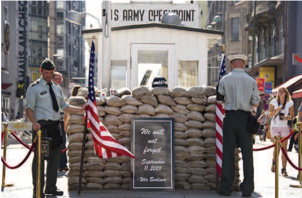
Berlin, Germany – This checkpoint in Berlin is at the site of the Berlin Wall. 11 German citizens perished at Ground Zero.